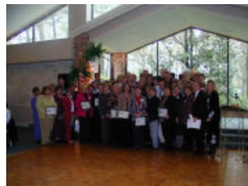
Spring ISD Teacher Appreciation Luncheon February 7th, Shirley Acres