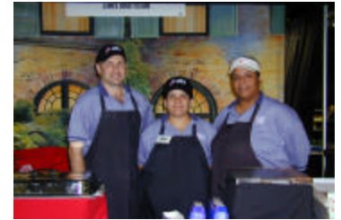
Epicurean Extravaganza 2004

Sam Houston Race Park 7575 N. Sam Houston Pkwy W