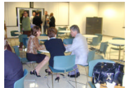
Members network at DeVry University at February Business After Hours