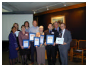
2004 Award Recipients