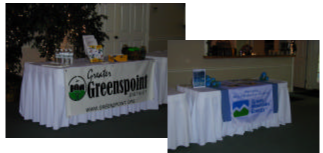
Marketing Tables at Spring ISD Teacher Appreciation Luncheon