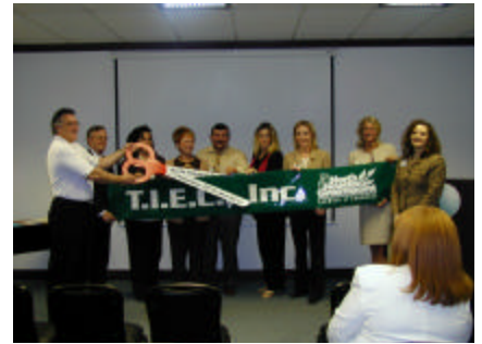
Texas International Engineering Consultants