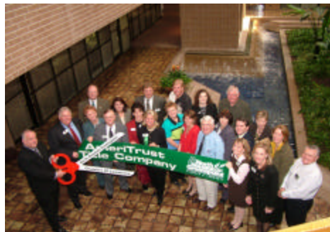
AmeriTrust Title Company

Please welcome these new members with your patronage!